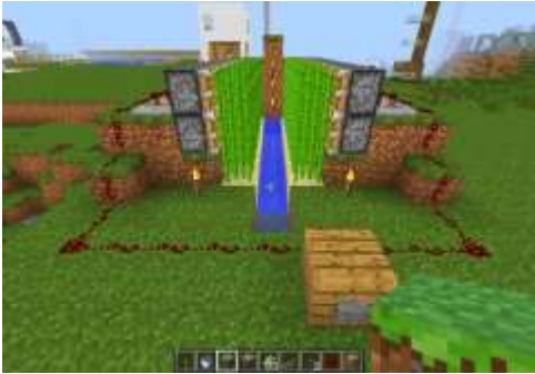
Redstone 2: Melon Farm