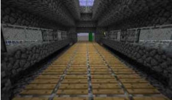
Redstone 4: Arrow Trap