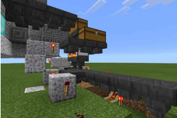
Redstone 3: Auto Cooker